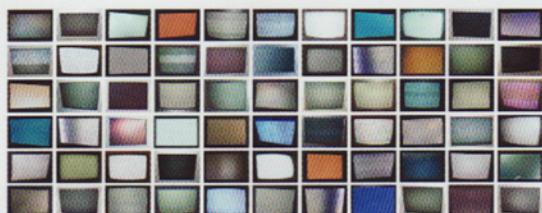
Cover: Penelope Umbrico, Signals Still / TVs from Craigslist (detail), 2011, 66 C-prints on metallic paper, 8½ by 11 inches each. See article beginning on page 79.